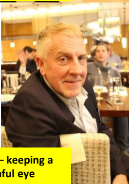
The Prez – keeping a watchful eye