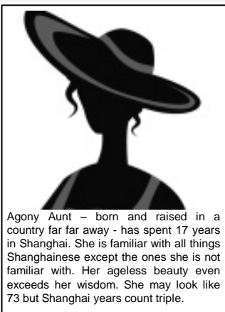
Agony Aunt – born and raised in a country far far away - has spent 17 years in Shanghai. She is familiar with all things Shanghainese except the ones she is not familiar with. Her ageless beauty even exceeds her wisdom. She may look like 73 but Shanghai years count triple.

Miss Ali Dagu Lu 380 -1 大沽路380-1号 Daily 11:00-01:00