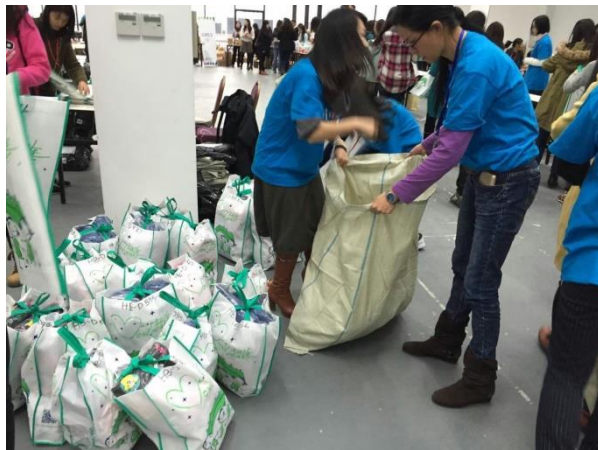
Gift bags being packed

In this spirit Rotarians sponsored 50 bags and with other volunteers packed over 900 bags on December 5 th .